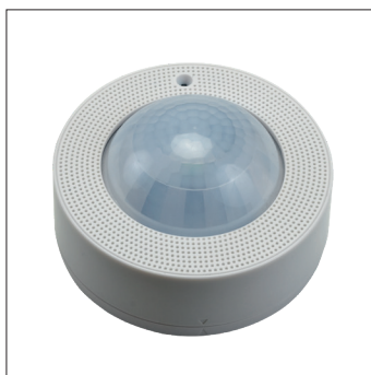
MCS IP65 wireless daylight&occ sensor